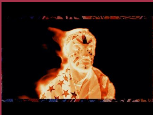
ABRASIVE! (PLAN A)(2021)